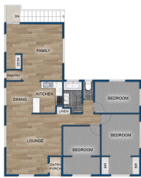
UPSTAIRS FLOOR PLAN