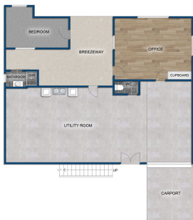
DOWNSTAIRS FLOOR PLAN

This floor plan including furniture, fixture measurements and dimensions are approximate and for illustrative purposes only. Realestate.com.au gives no guarantee, warranty or representation as to the accuracy and layout. All enquiries must be directed to the agent, vendor or party representing this floor plan.